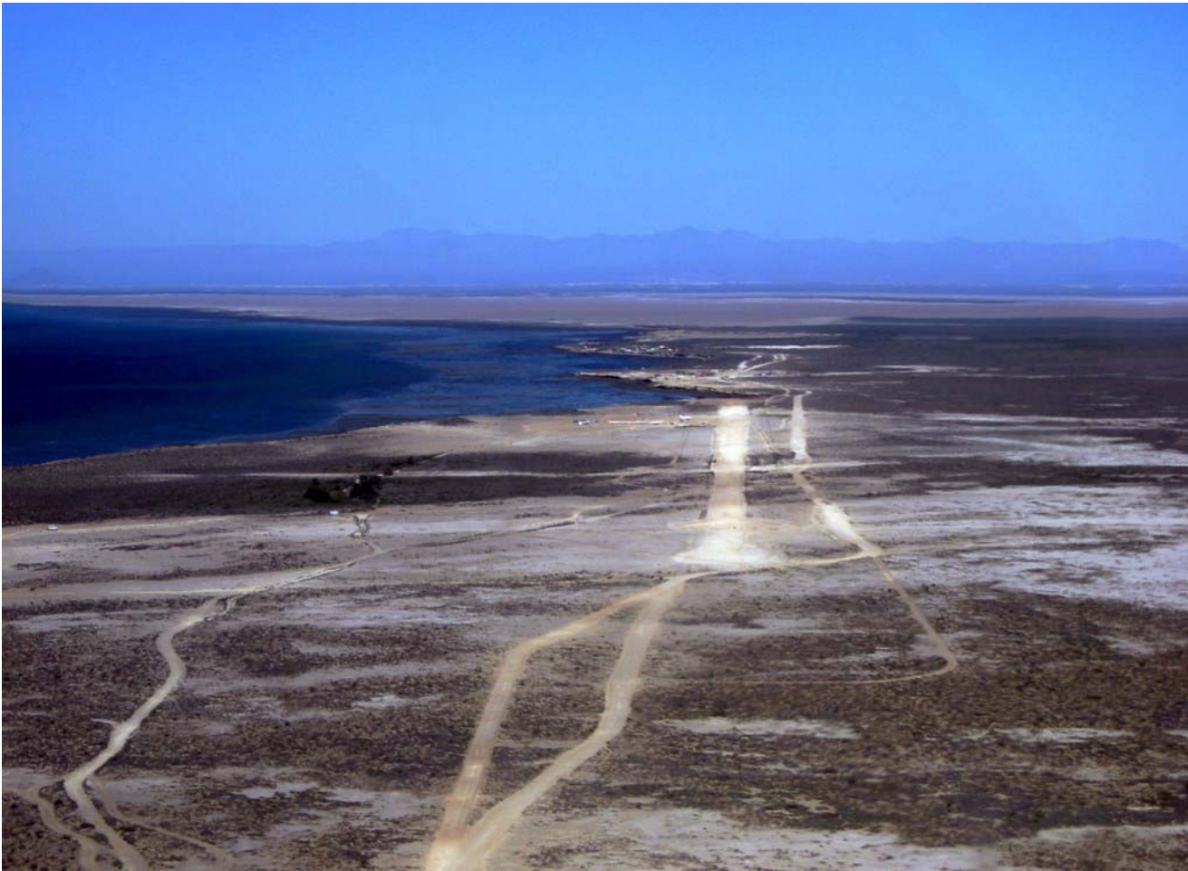
Landing to the north at Laguna San Ignacio